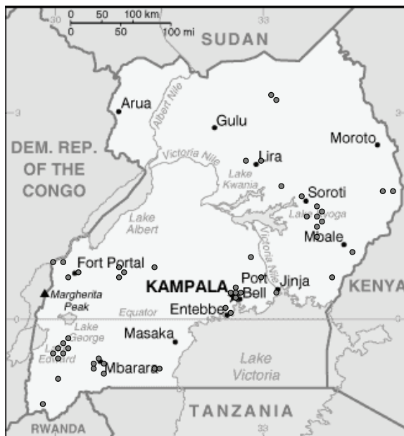
Figure 1: Distribution of facilities visited in Uganda

All of the facilities approached agreed to take part in the study. The sites that were visited are listed in Appendix E and their geographical distribution is shown in Figure 1. Each facility visit took approximately one day, with many requiring a return visit to complete data collection.