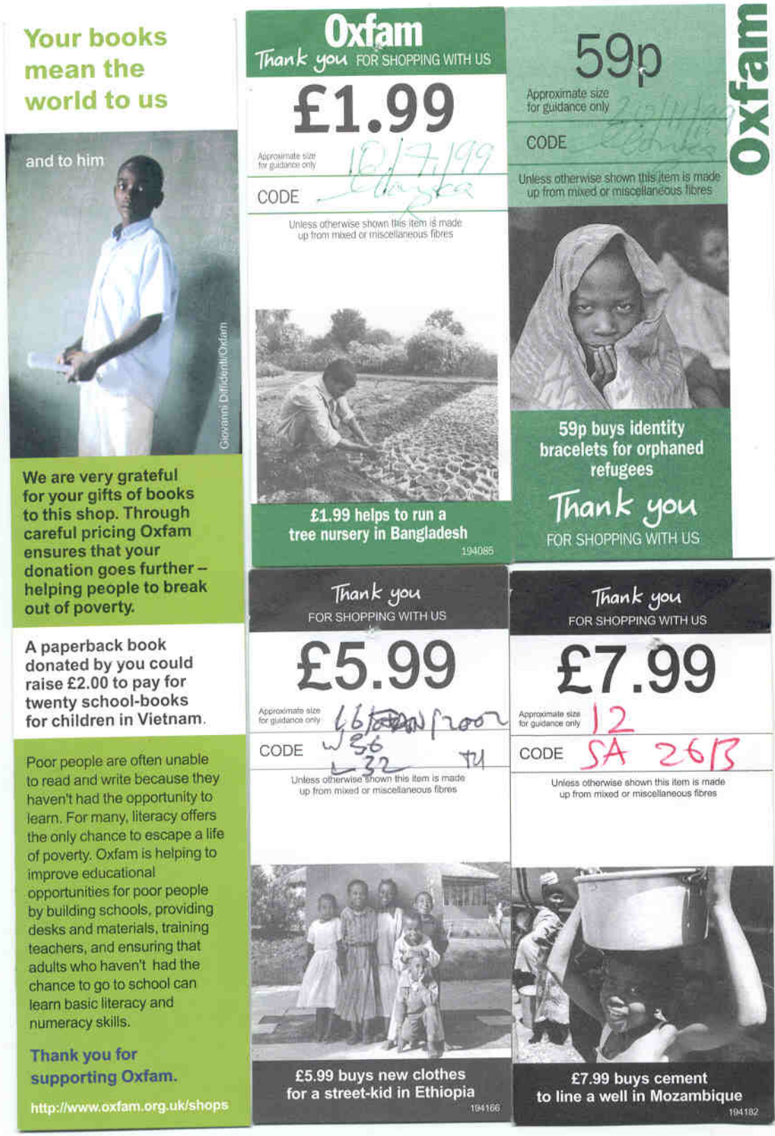
Figure 3. Oxfam: Sales tags