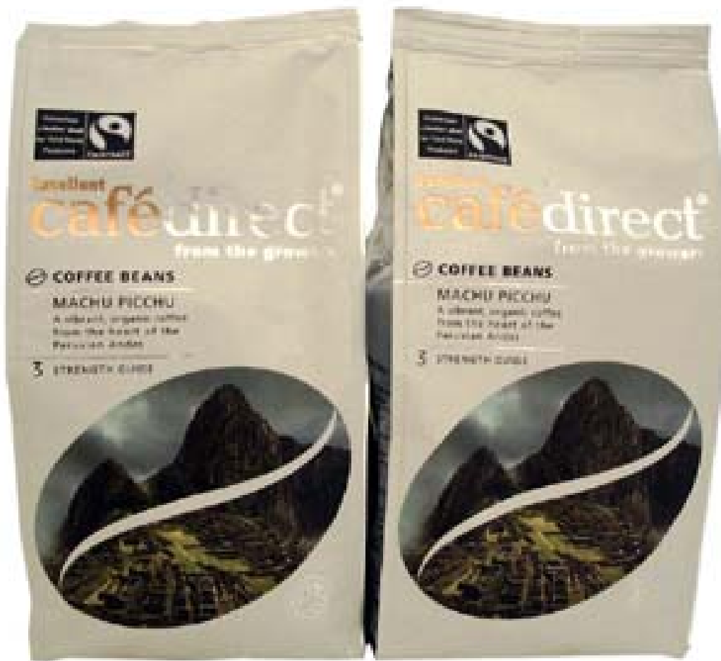
Figure 4: Machu Picchu Fair Trade Coffee