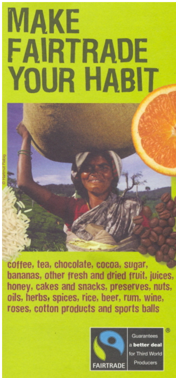
Figure 1. Making Fairtrade images and discourses your habit