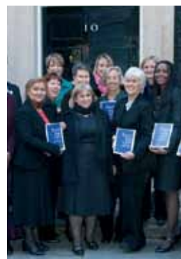
Visit to 10 Downing Street