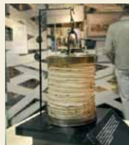
Florence Nightingale Museum

The School collaborates with Guy's and St Thomas' NHS Foundation Trust to celebrate nursing education. A film show, interactive education classes, drop in sessions and exhibits featured all things educational – from exam papers to competence assessment books.