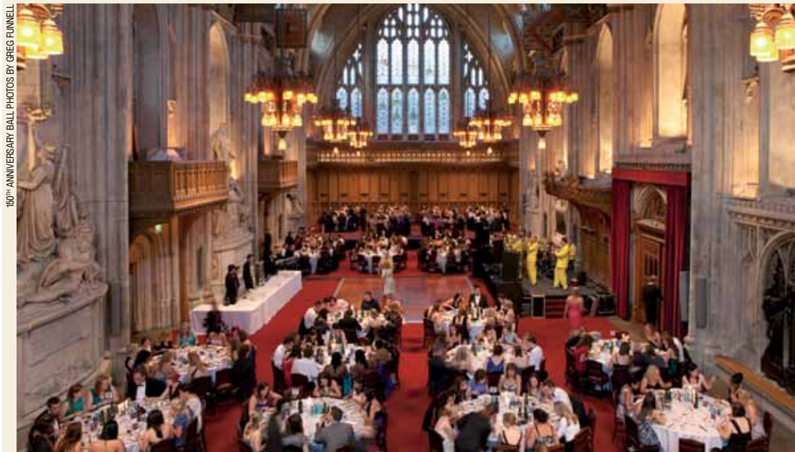
150 th ANNIVERSARY BALL

July 2010 Next Generation Nightingales 150 th anniversary ball On Friday 9 July staff, students and friends of the School gathered to celebrate our 150 th anniversary at London's prestigious Guildhall venue. The event was an opportunity for everyone to enjoy the School's achievements over the past 150 years and look to the future of the nursing and midwifery profession.