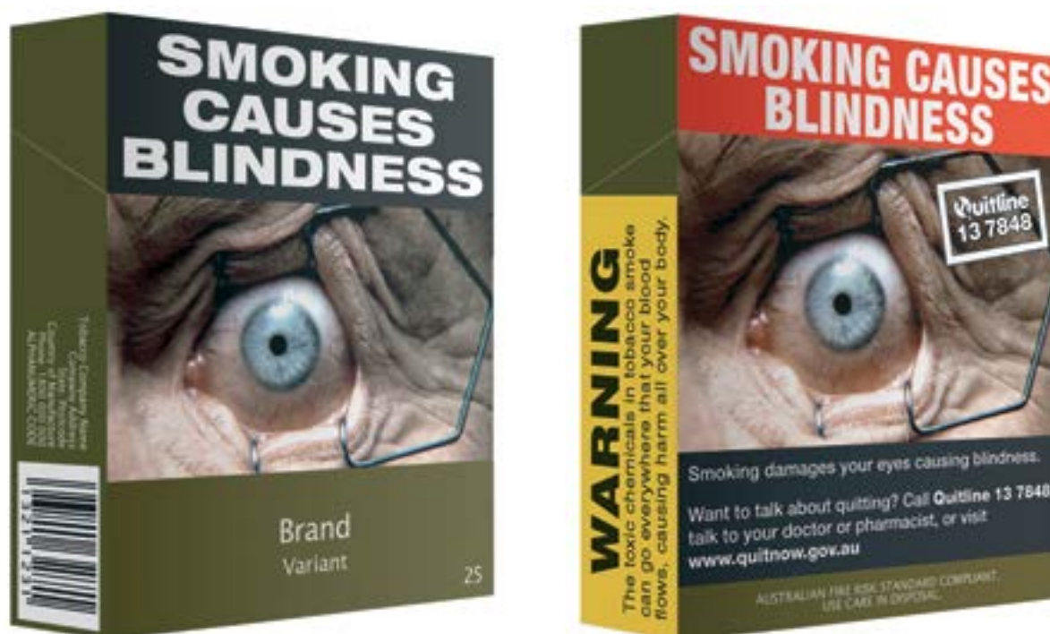
Figure 1: Australian plain pack example (front and back)