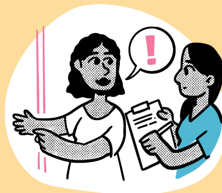
Advocating for the care their loved one needs