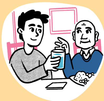
Help with eating and drinking at mealtimes

A care supporter can provide physical or emotional support to a loved one in addition to input from health and care staff. This could include: