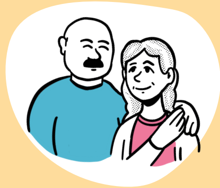
Offering reassurance and companionship