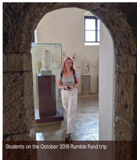
Students on the October 2019 Rumble Fund trip