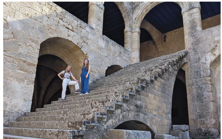
Students on the October 2019 Rumble Fund trip