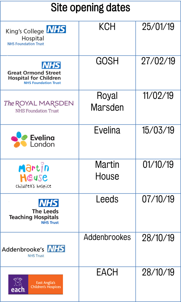
Site opening dates