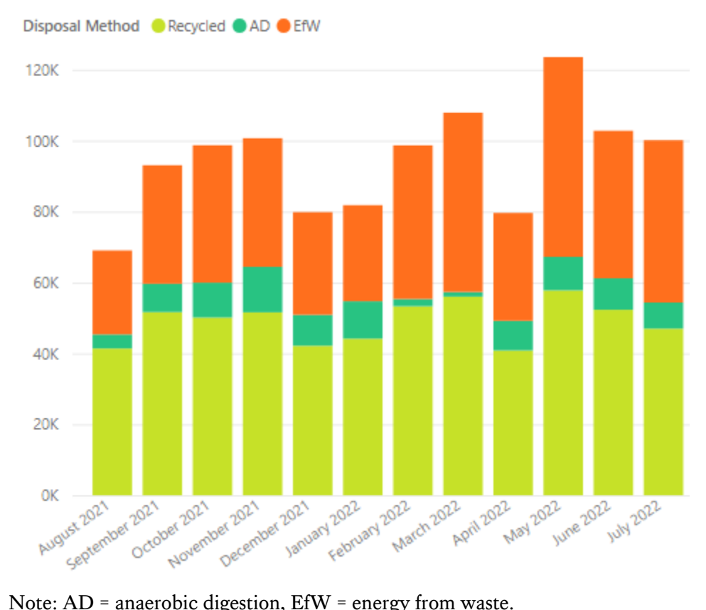
Figure 1: Total operational waste by disposal method per month (kg) in 2021-22

Note: AD = anaerobic digestion, EfW = energy from waste.