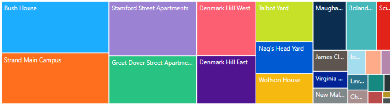
Figure 2: Total operational waste (kg) per property (campus and residences) in 2022-23