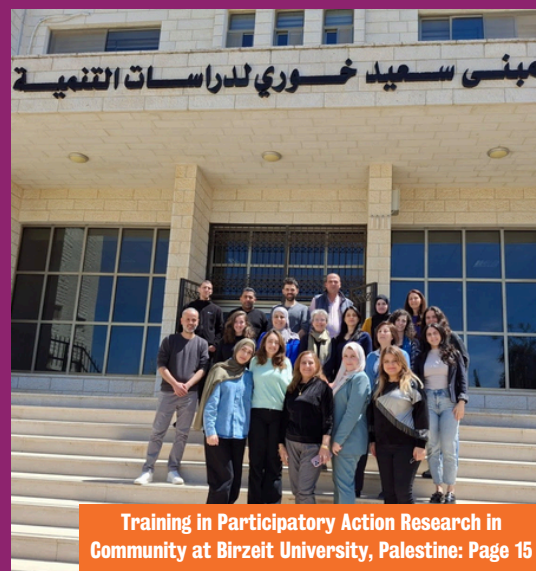
Training in Participatory Action Research in Community at Birzeit University, Palestine: Page 15