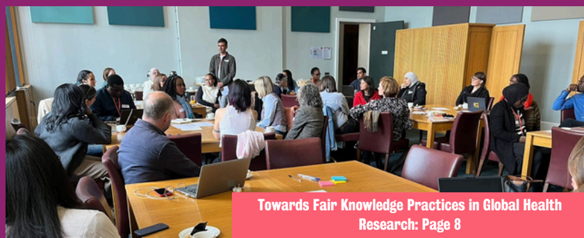
Towards Fair Knowledge Practices in Global Health Research: Page 8