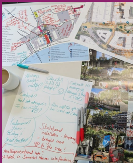
Mapping Strands: A Wellbeing Walkshop: Page 5