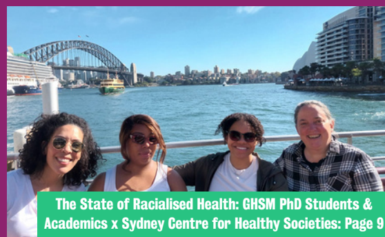
The State of Racialised Health: GHSM PhD Students & Academics x Sydney Centre for Healthy Societies: Page 9