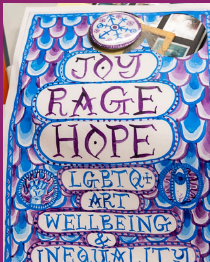
Joy Rage Hope: LGBTQ+ Art Workshops: Page 14