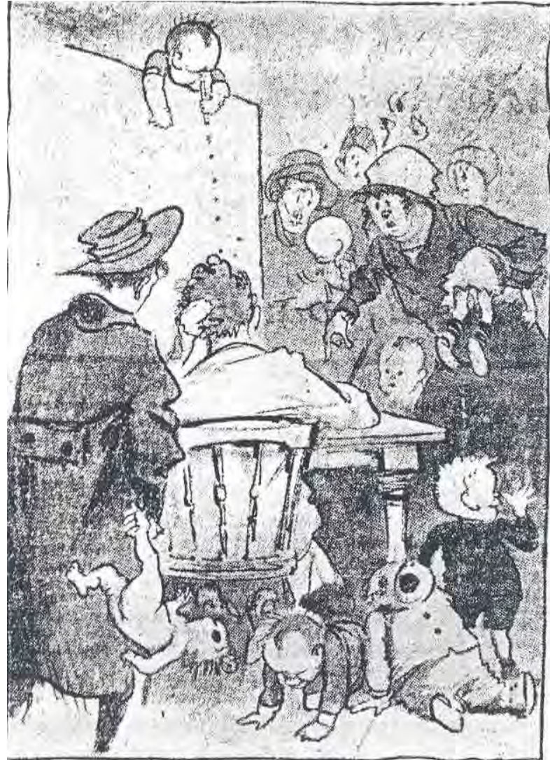
THE LADY ALMONER—or a "Rest-Cure." DAILY TELE