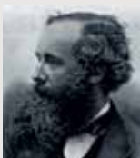
James Clerk Maxwell

KING'S COLLEGE LONDON and its constituent institutions have been associated with some of the greatest innovators of their time, including Sir Charles Lyell, founder of modern geology; Sir Charles Wheatstone, pioneer of current electricity and wireless telegraphy; John Frederic Daniell, inventor of the constant-cell battery; Thomas Hodgkin, Thomas Addison and Richard Bright: distinguished doctors who identified the important diseases that are named after them; FD Maurice, founder of the Working Men's College and campaigner for women's higher education; physicist James Clerk Maxwell, Einstein's predecessor in electromagnetism and relativity; Florence Nightingale; and Lord Lister, who established antiseptic surgery and is known as 'the father of modern medicine'. Among the many writers educated at King's were Romantic poet John Keats (once a medical student at Guy's), novelist Thomas Hardy, WS Gilbert of Gilbert and Sullivan fame, Virginia Woolf and Arthur C Clarke.