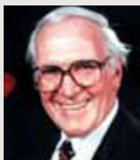
Sir James Black