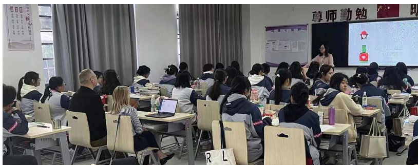
Above top: King's teachers observing classes in Nanjing