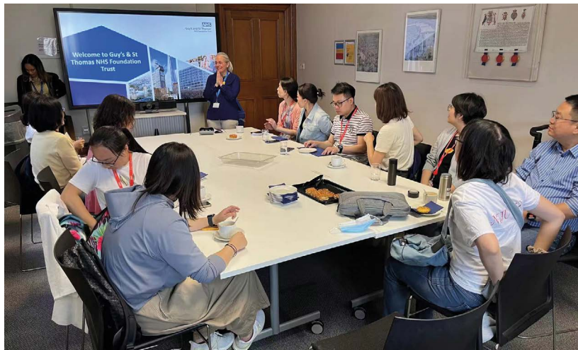
Above left: July delegation visiting St Thomas Hospital