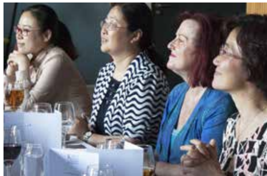
CENTRE: THE NANJING DELEGATION WITH COLLEAGUES FROM KING'S COLLEGE LONDON.