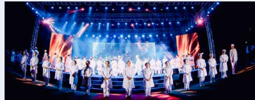
NANJING HEALTH SCHOOL NURSING STUDENTS TAKE PART IN THE CAP-AWARDING CEREMONY, INCLUDING PERFORMANCES AND DANCING.