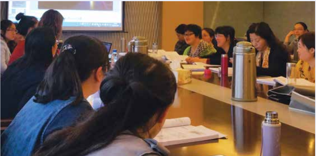
LEFT: LOCAL HEALTH STAFF ATTEND AN EDUCATIONAL SESSION LED BY KING'S COLLEGE LONDON.