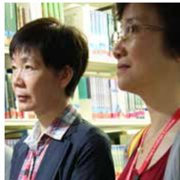
ABOVE: TOURING THE LIBRARY.