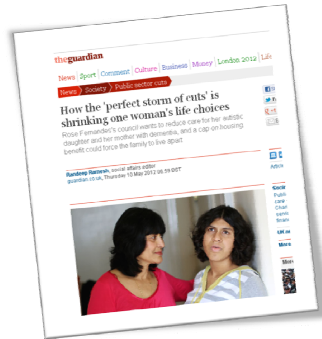
The Guardian 10 May 2012