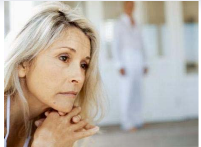
Picture accompanying Daily Telegraph article by Max Pemberton in June 2009